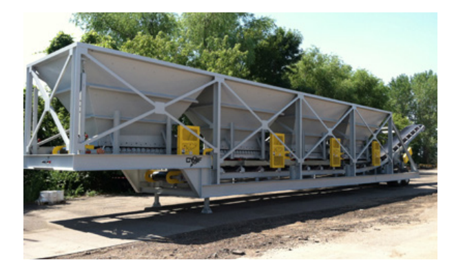
1. Cold Feed System