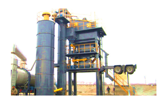
5. Mixing System