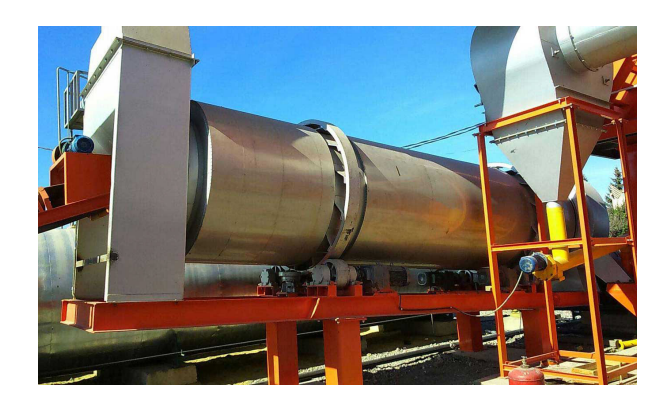
3. Dryer & Burning System