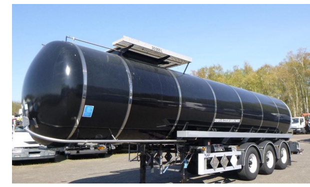
4. Bitumen Supply System